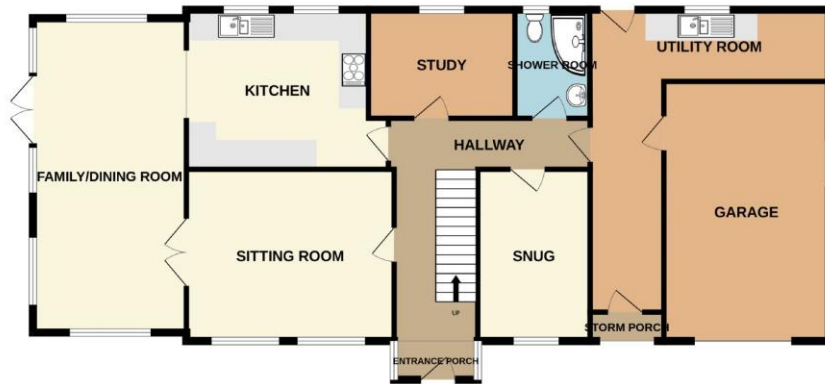
GROUND FLOOR 1420 sq.ft. (131.9 sq.m.) approx.