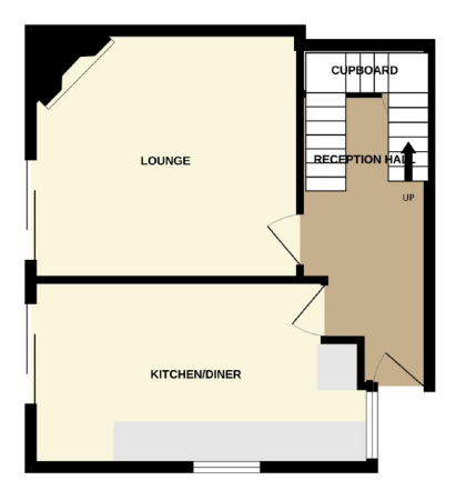
1ST FLOOR 614 sq.ft. (57.0 sq.m.) approx.